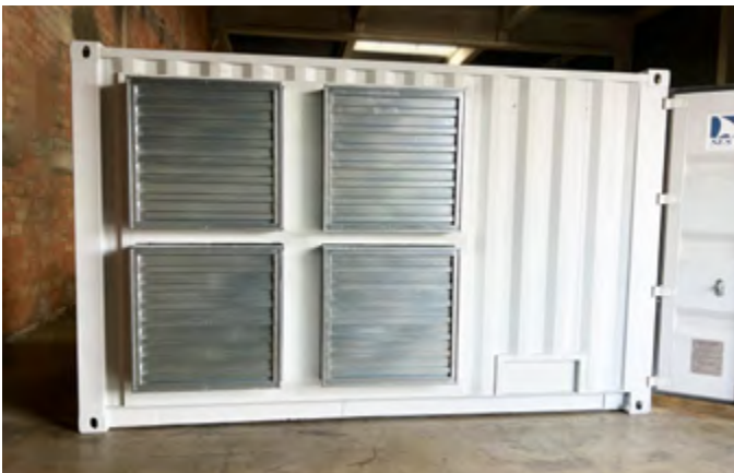
12ft container + fans

We have the experience and have already setup multiple sites the past few years. Providing knowledge to support you on every aspect of the project.