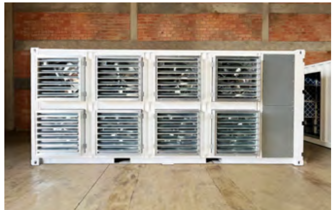
20ft container + fans