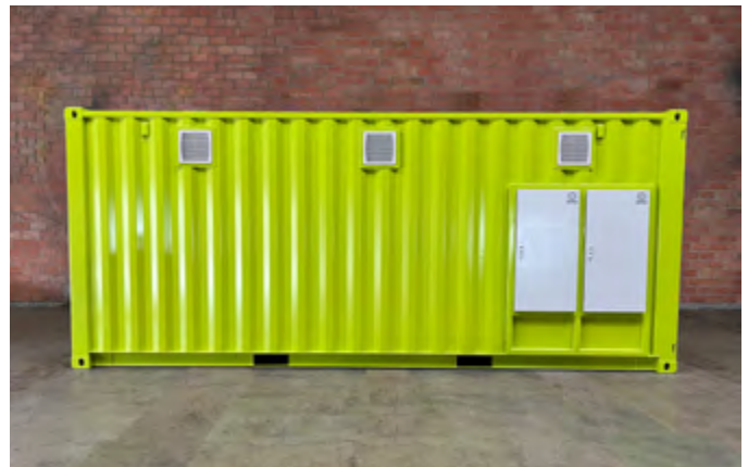
different colors or branding